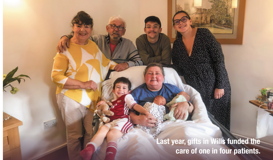
Last year, gifts in Wills funded the care of one in four patients.

The Hospice building in York has an in-patient unit for those who need round the clock care. It also provides a base for our community support teams which aim to enhance the independence of patients and help them live well by managing symptoms and offering emotional, social, and spiritual support. Our established Hospice@Home service and our developing community based support services offer care for people across the region. This could be in their own homes or in other community buildings.